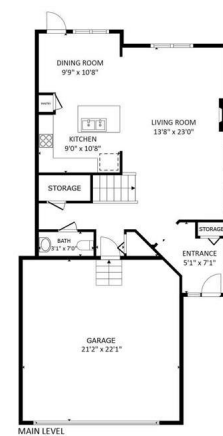
119 Cimarron Vista Crescent - Okotoks MAIN LEVEL: 813.5 SqFt, GARAGE: 491.5 SqFt