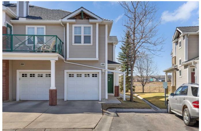
39 Hidden Creek Pl NW #304

Welcome to this beautiful end-unit in Hidden Valley's Hansen Creek Manor! West Backing onto a beautiful nature reserve with a freshwater pond and nestle in very conveniently located in a sought-after community of Hidden Valley NW. This single front attached garage townhouse is idle and perfect for those attempting to downsize into a quiet living space, surrounded by a welcoming neighbourhood with exceptional scenery and many walking paths. Also good for First-Time Home Buyers or investors to live or grow their equity. This home offer you ground floor single attached garage parking and 2nd floor quite living with the beautiful views from spacious and bright living room with cozy fireplace and dining. A very Bright and open concept floor plan loaded with two bedrooms and two bathrooms, open kitchen and dining, multiple pantries and closets. A big master bedroom with 4 pcs ensuite allow you to have your sound sleeps quietly. When the living room off the patio door the huge and sunny deck welcome you for the more sounding nature views and warmth for your summer BBQ to you and your guests. This home is very conveniently and closely located to the Schools, Gas Station, Small plaza with restaurant and other. Also only 2-5 minutes drive to Creekside Shopping Centre. A very easy and quick access to the STONY TRIAL allow you to drive to BANFF, EDMONTON and City-Centre wherever you want to. This home comes equipped with a stairlift for