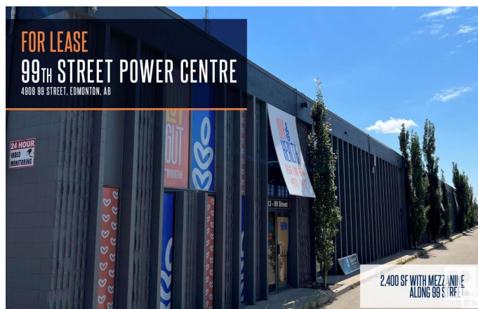
FLOOR PLANS / 99TH STREET POWER CENTRE 4809 99 STREET, EDMONTON, AB